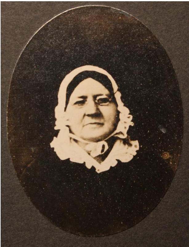
Mary (Polly) Young Pickersgill, c. 1850, aged 74 Collection of the Star-Spangled Banner Flag